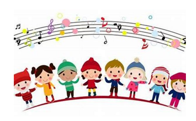
God be with you and bless you.

'Joy to the World, the Lord has come. Let earth receive her King'.